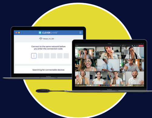
Connect to CleverShare with one-tap