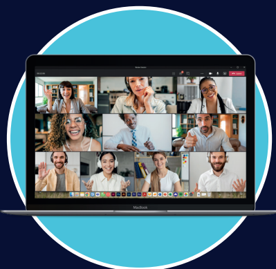
Start the meeting from your laptop